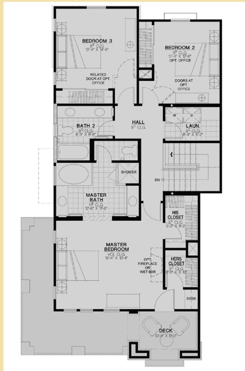
Level 2 of 2